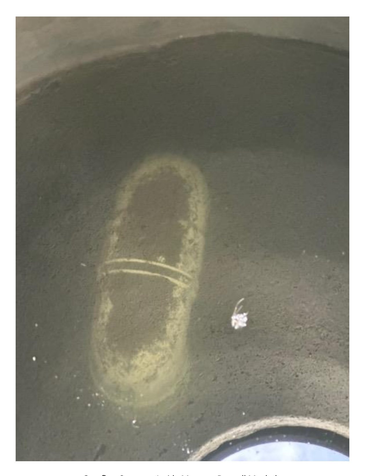
Overflow Structure Inside Montage Drywell Manhole