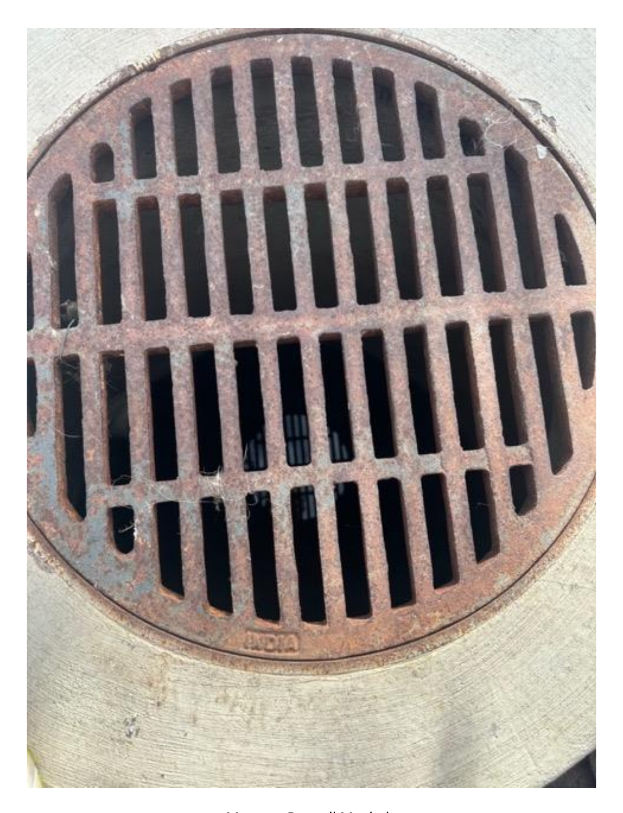
Montage Drywell Manhole