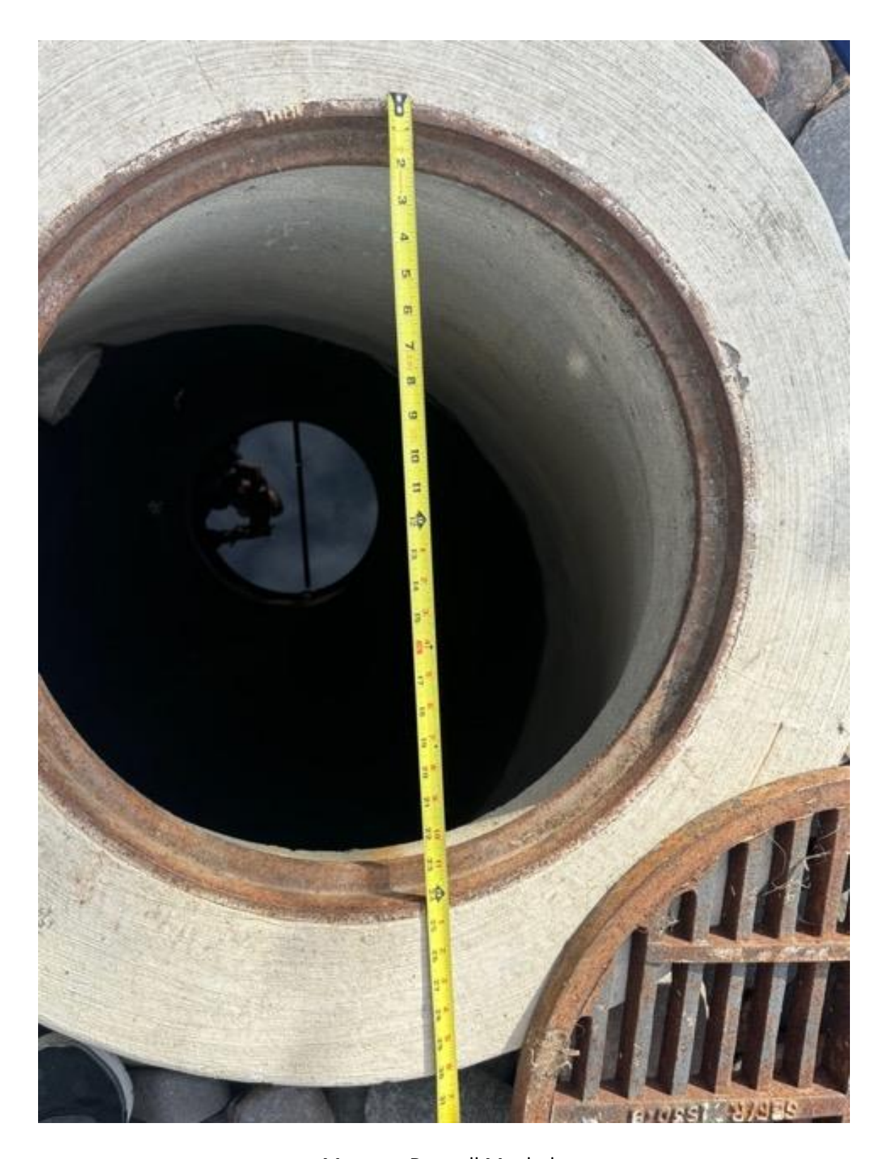
Montage Drywell Manhole