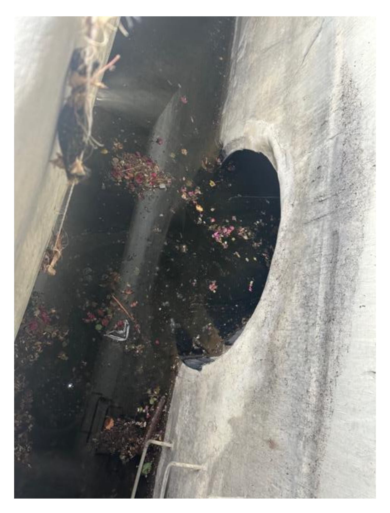
Inside East Stormwater Box Culvert and Connecting Drywell Inlet Pipe and Access Ladder. Mosquito Mitigation Package Hanging from Culvert Grate