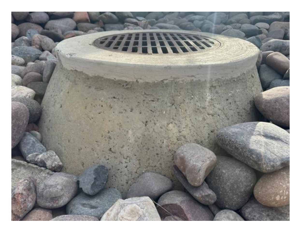
Montage Drywell Manhole