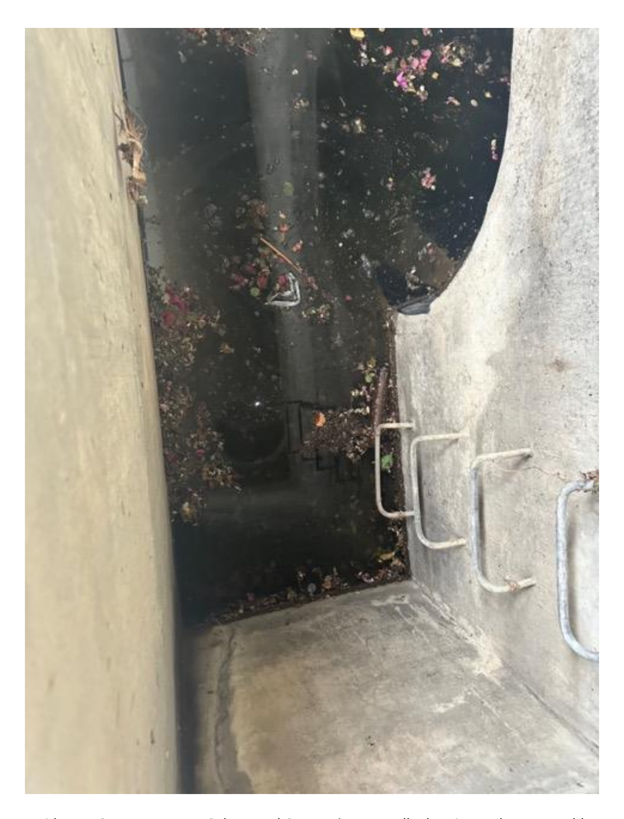
Inside East Stormwater Box Culvert and Connecting Drywell Inlet Pipe and Access Ladder