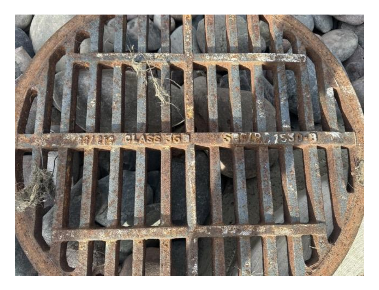
Montage Drywell Manhole with Manhole Cover Markings