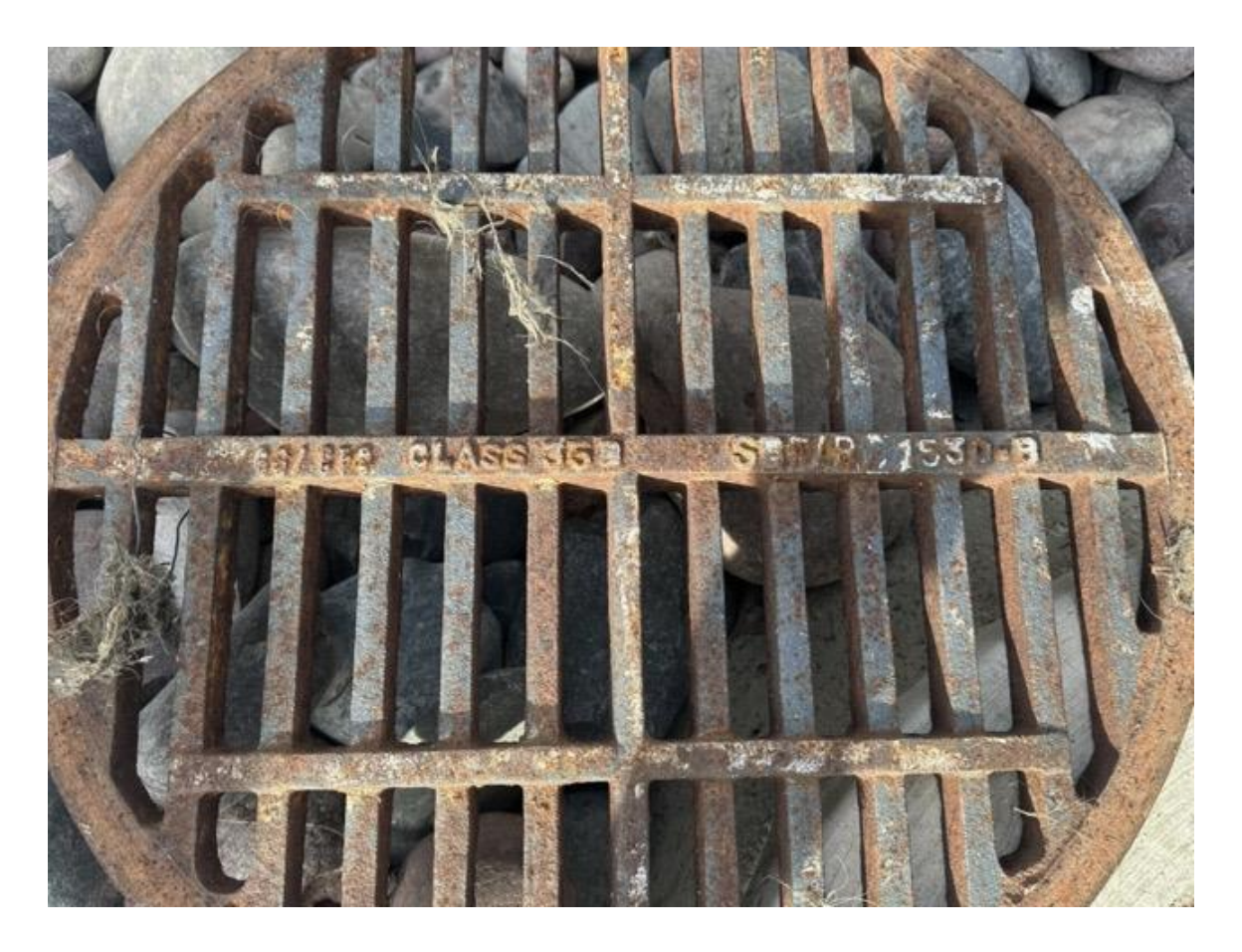
Montage Drywell Manhole