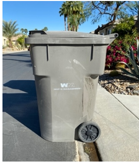
Bin wheels blocking water flow

Trash —Tuesday is our trash pickup day. Our rule states: “trash bins shall not be put out earlier than 24 hours prior to pickup and brought back in within 24 hours after pickup.” If you are a part-time resident please consider the roll-out service provided by Burrtec.