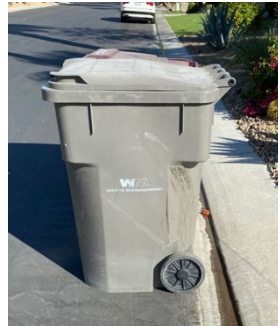
Bin wheels are on black asphalt

We want you to be aware that Burrtec’s pickup time fluctuates on Tuesday. In order to make sure that your trash is collected you should have it on the street by 7:00 am on Tuesday morning. If you put your trash out later than that you may miss the pickup. Please don’t put your trash bins in the gutter, it blocks the flow of water to our detention basin. Place your bins on the black asphalt.