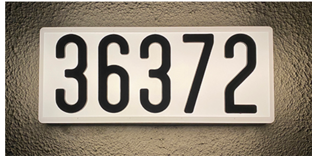
EXAMPLE B: Brighter LED light and numbers fit