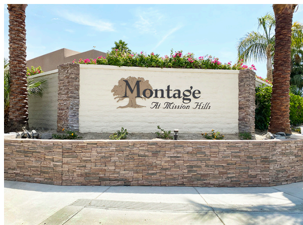
In the afternoon—the wall is finished