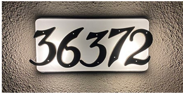
EXAMPLE A: Sign too small and numbers don't fit

Many of our homeowners in Montage have already installed this LED fixture and they have received many compliments. Remember that it is money well spent—the new LED will last years, and will aid emergency vehicles in finding your address.